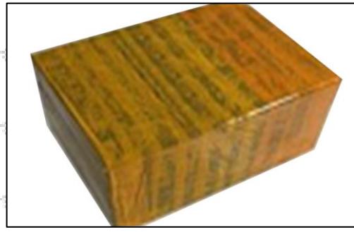
Pic No. 3