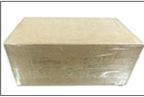
Pic No. 2